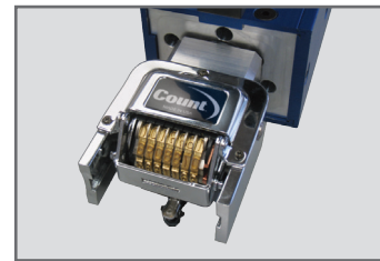
Numbering Head Wheel With Font Style Gothic (7)

The COUNT™ TableMatic Plus offers an easy, economical numbering solution that's ideal for small jobs that turn quickly. The TableMatic Plus can be used for crash numbering of NCR forms up to 6 parts, or numbering virtually anywhere on the paper. The simple foot pedal operation means anyone in your shop can use it, yet offers a range of features: drop zeros, a repeat function, numbering head pressure adjustment and a patented self-inking cartridge. Plus, a magnetic backstop and built-in side rails ensure consistently accurate registration.