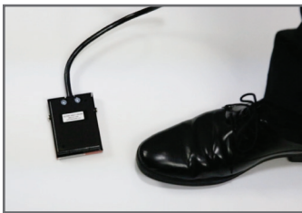
Simple Foot Pedal Operation

This simple-to-use numbering solution accommodates small jobs for quick delivery to your customers.