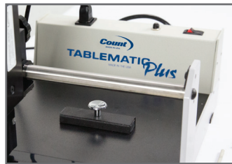
Magnetic Back Stop