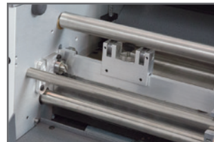
CAM Actuated Compression Creasing