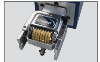
Numbering Head Wheel With Font Style Gothic (7)

With the FC114 series, you can handle high quality numbering, creasing and perforating all-in-one. The latest addition to the series, the COUNT FC114ASP includes a strike perforating head, capable of partial page and intermittent perforating. Strike perforating makes it easy to create custom 2 and 3-part partitions.