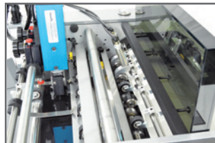
Strike Perforating Head

One easy-to-use machine to meet all your numbering, creasing and perforating needs.