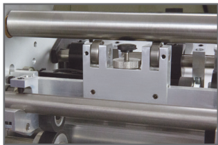
CAM Actuated Compression Crease

The COUNT™ AccuCreaser Air provides fast, consistent quality creasing and perforating with a variety of features that make it top of its class. Get super accurate CAM actuated compression creasing with rotary perf/score capabilities, including micro-perf (up to four at a time), and automated distance recognition to support auto set-ups for a variety of creases, even perfect bind set-up. The AccuCreaser Air utilizes a bottom vacuum paper feed with a built-in register guide to ensure accuracy with every sheet.