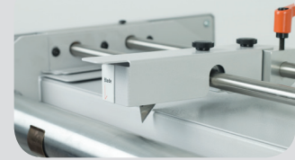
Retractable cutting blades