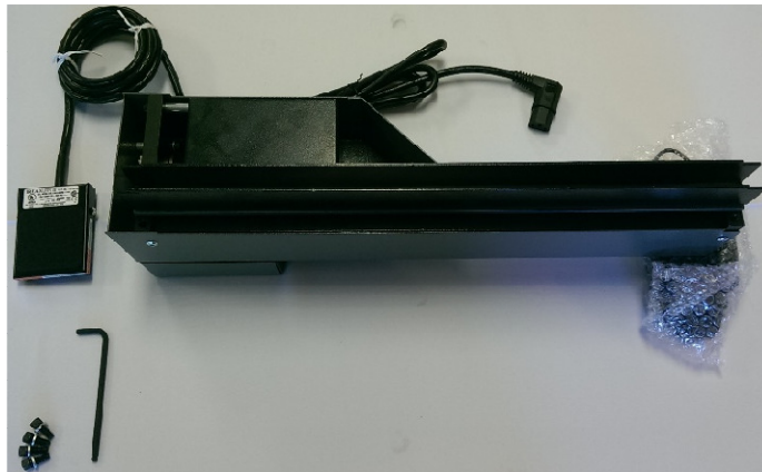
FIGURE 3: Orientation of Electric Creaser Head

Congratulations! Your Martin Yale Creaser has now been upgraded!