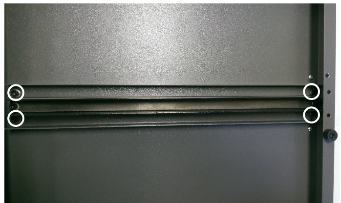
FIGURE 2: Remove/Reinstall Four Screws