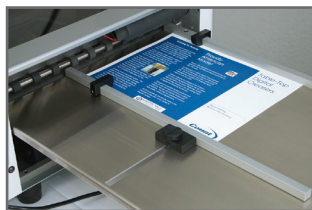
One Step Feed