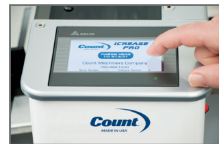
Touch Screen Controller

The COUNT™ iCrease Pro is a simple yet robust solution for creasing of digital media to eliminate cracking when folding. The iCrease Pro gives you the automation of bigger COUNT machines in a simple hand-feed machine anyone can use.