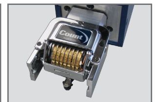
Numbering Head Wheel With Font Style Gothic (7)

The COUNT™ NumberPro is a basic hardworking solution for numbering, perforating and scoring on a wide range of paper stocks. Simple touchscreen programming allows you to number, perf (including micro-perf) or score individually or simultaneously. Number virtually anywhere up to 12 times per sheet, and add a second head for an additional 12 times – or crash number carbonless forms (up to 6 parts). Includes the patented self-inking cartridges to eliminate re-inking.