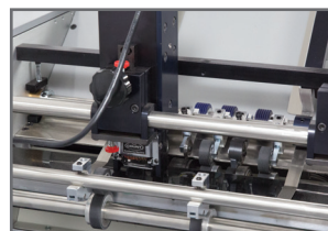
Capable of Using Two Numbering Heads

A numbering, perforating and scoring machine that's fast, easy to use and reliable.