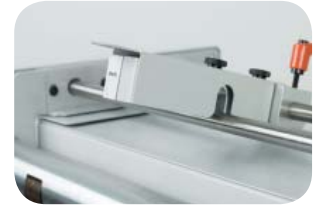
Retractable cutting blades