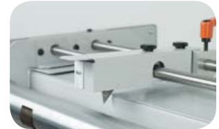
Retractable cutting blades